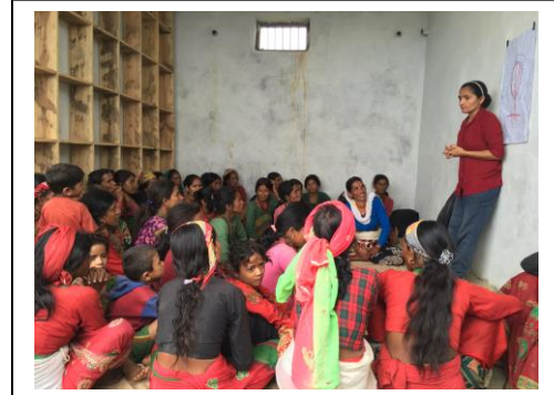
Figure 4 Discussion with Women's group

Likewise, during day time, had discussion with municipality members. They worked in four different groups; i) what is menstruation, ii) what are policies on dignified menstruation including analysis of manifesto of key political parties as well as constitution, iii) the current programs on dignified menstruation and iv) the status of dignified menstruation in public institutions and presented in plenary. The mayor and vice mayor spoke on their commitment though it is vague.