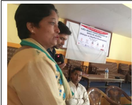
Figure 15 Vice Chair addressing program

concepts were included; dignified menstruation including democracy, constitution, human right, rule of law and role of political leaders, faith healers, women, girls, men and boys. The vice mayor chaired and LDO was chief guest of the program.