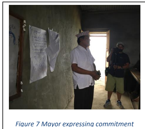
Figure 7 Mayor expressing commitment

Few political leaders expressed their anger due to police case and few were resisting for culture