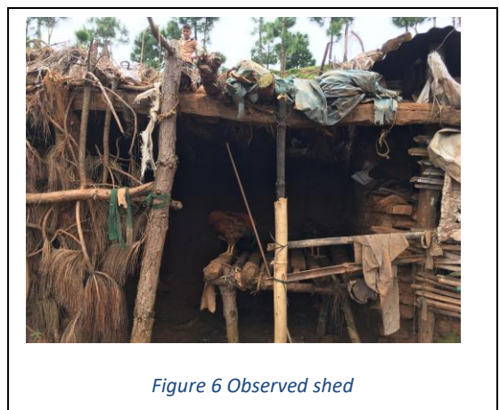
Figure 6 Observed shed

and religion. Later, they convinced while team discussed on construction of nature and society as well as constitution and role of local government.