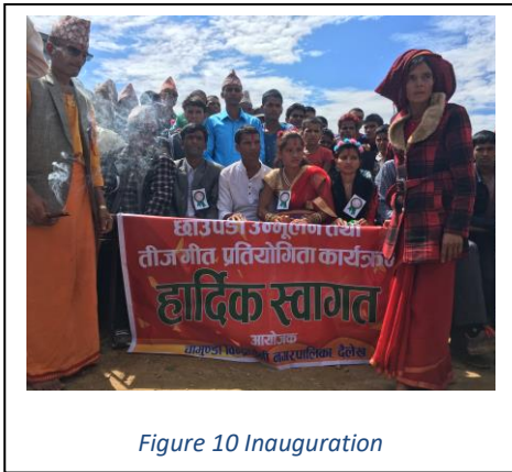
Figure 10 Inauguration