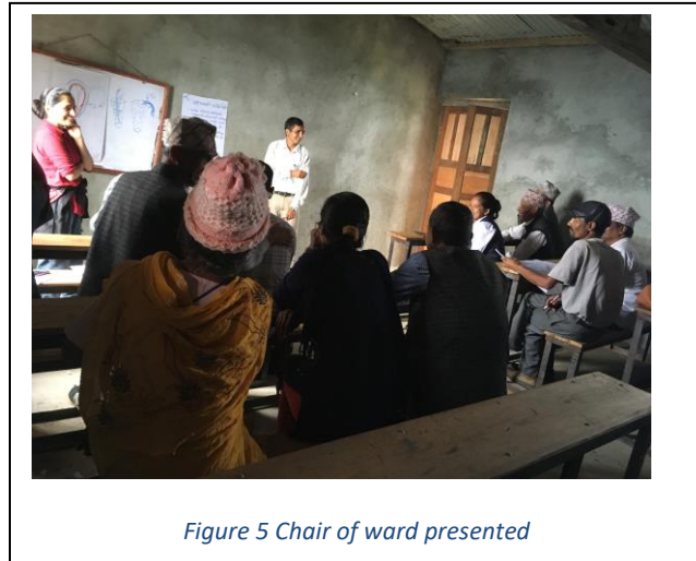
Figure 5 Chair of ward presented