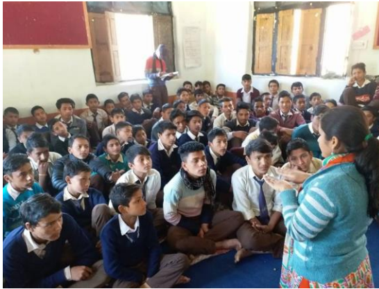
Engaging Boys on Dialogue on Dignified Menstruation

https://www.youtube.com/watch?v=nXVFdqzKML4 , Print media during the conference at University do Parto in Portugal: https://www.msn.com/pt-br/video/musica/radha-paudel-em-portugal-para-falar-de-discrimina%C3%A7%C3%A3o-das-mulheres-nepalesas/vp-BBKDazn