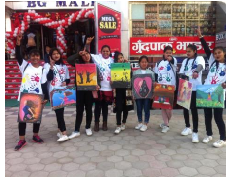
OBR Feb 14, 2018

The team has also engaged men to fights against chhau . Utilizing the same resources this group has conducted many sessions of dialogue and interaction with media, student, teachers, politicians, faith leaders and women leaders at Achham, Bajura, Chitwan, Kavre, Sindupalanchok, Nuwakot, Kathmandu, Bhaktapur etc. It also involved young candidate to speak about dignified menstruation and sanitation with the locals in Chuangsar, Kerung on the special occasion of inauguration of co-operation for women by roots for life.