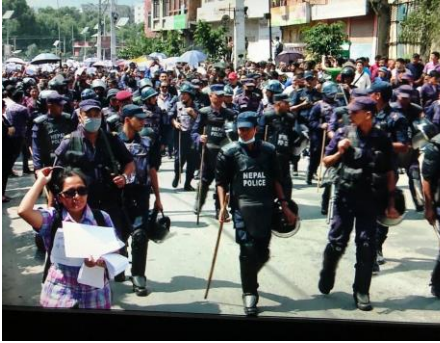
Solidarity for Justice for all Rape Victims

On the month of January the team had drafted a mini hand book entitled “Dignified Menstruation” is everyone’s business, deconstructing over four dozen of myths and misconceptions. On the month of February, the team along with 170 students jointly launched the mini handbook at Boston International College at Chitwan followed by interaction program.